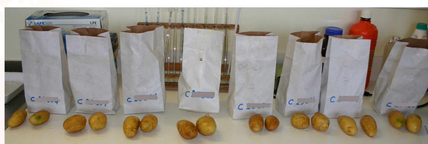
Preparation of the samples received by FN3PT participant for DNA extraction